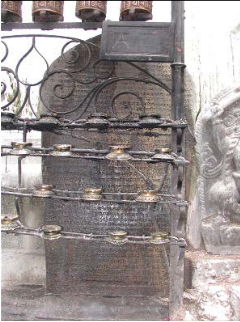
Plate 11. Inscription from 1657 set up on the drum of the Svayambhūcaitya next to the niche housing Amitābha. It gives the text of the Svayambhūbhattāarakastotra composed by Pratāpa Malla. Despite the title (“Hymn in Praise of the Venerable Svayambhū”) and its resonance with the title of the short version of the Svayambhūpurāṇa — Svayambhūcaityabhattāarakodeśa —the poem is a thinly veiled hymn of Śambhū (i.e., Śiva) rather than of Svayambhū.