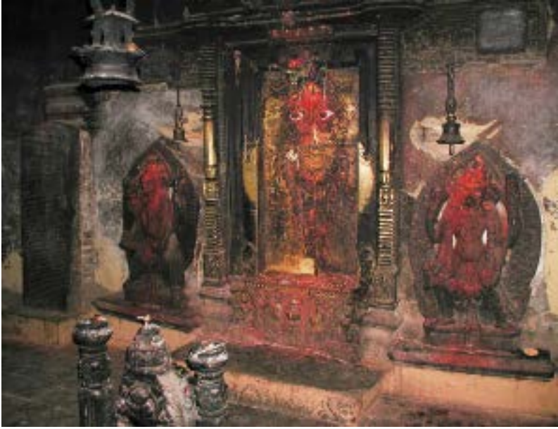
Plate 5. The door leading from the vestibule into the inner sanctum of Śāntipur. Entry into this secret tantric shrine is restricted to the most senior member of the buddhācārya clan in charge of Svayambhū and their priest. Marked with two eyes, the door depicts Saṃvara, the principal deity of Śāntipur, who is worshiped here from outside. The flanking images of the goddess Kākāsyā and Ulūkāsyā guard the door in accordance with their function in the Saṃvaramaṇḍala. The inscription on the far left commemorates Pratāpa Malla's incursion into the shrine undertaken at the time of drought in order to pacify the serpent deities and bring about rain.