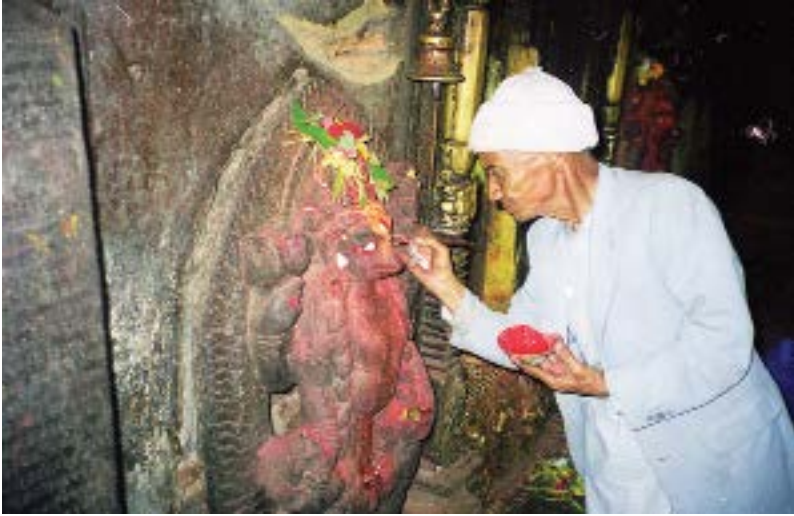
Plate 12. On the eve of the full-moon day of Kārtika (October 24, 1999), the citrakar traditionally in charge of Svayambhū repaints the eyes of the crow-faced goddess Kākāsyā, who guards the entrance into the inner sanctum of Śāntipur together with the owl-faced Ulūkāsyā on the other side of the door. Ever year this full-moon day serves as an occasion to revitalize Svayambhū. In addition to repainting the eyes of Kākāsyā and Ulūkāsyā, the citrakar repaints the facial features on the door flanked by these two protector goddesses. He also repaints the eyes and other marks on the caitya's harmikā, the faces of the statues in the niches of the dome, as well as the shrine of Agnipur and other such iconic objects around Svayambhū.