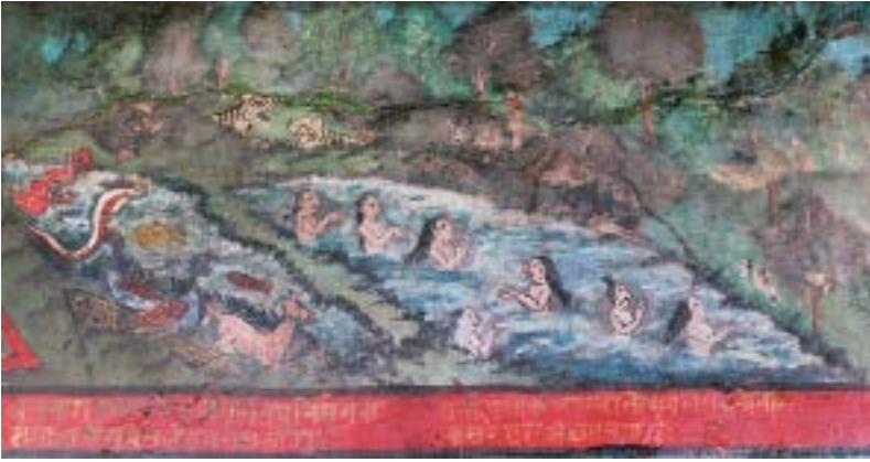
Plate 9. Scene on the northern wall depicting the primordial lake covering Nepal even before the manifestation of Svayambhū. The accompanying captions read "Here, water creatures living in the lake Nāga Abode and forest creatures abiding in the (surrounding) forests" ( thana nāgavāsadabasa jalajamtupanisenam vāsa yānā cogu vanajamtu vanasa cogu: ), and "Here, deities and apsaras taking a bath in the lake Nāga Abode" ( thana devaloka-apsarālokapani sakalem nāgavāsa dabasa a[sn]āna yāgu: ).