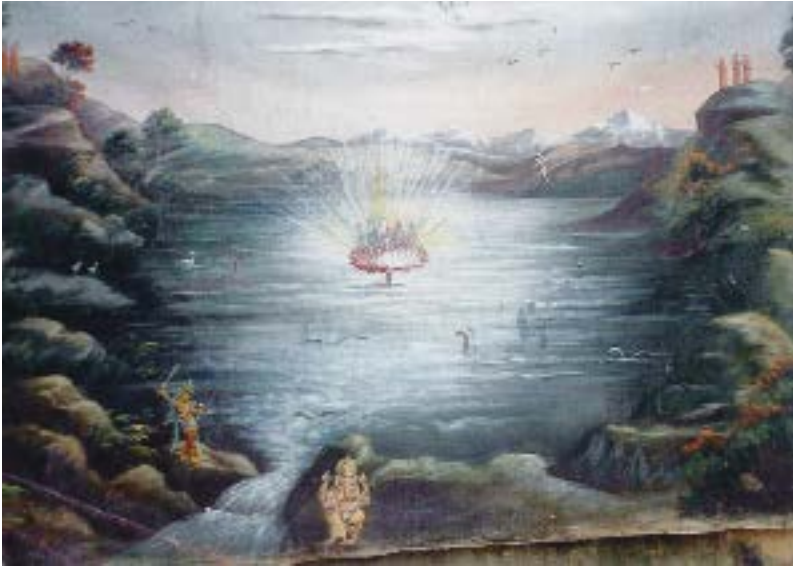
Plate 3. Scroll painting (circa 6 by 4 feet), belonging to Maru Bāhāḥ monastery of Kathmandu, as displayed during the full-moon day in August 1997. The painting depicts the self-origination of the five buddhas in the form of light ( jyotirūpa) upon a lotus flower made of gems, arisen from the lake then covering the Kathmandu Valley. The five buddhas constitute collectively the principle of buddhahood and here represent Svayambhū. In the foreground Mañjuśrī can be seen with his sword raised for cutting a gorge into the encircling ring of mountains so as to release the lake's waters and drain the valley.