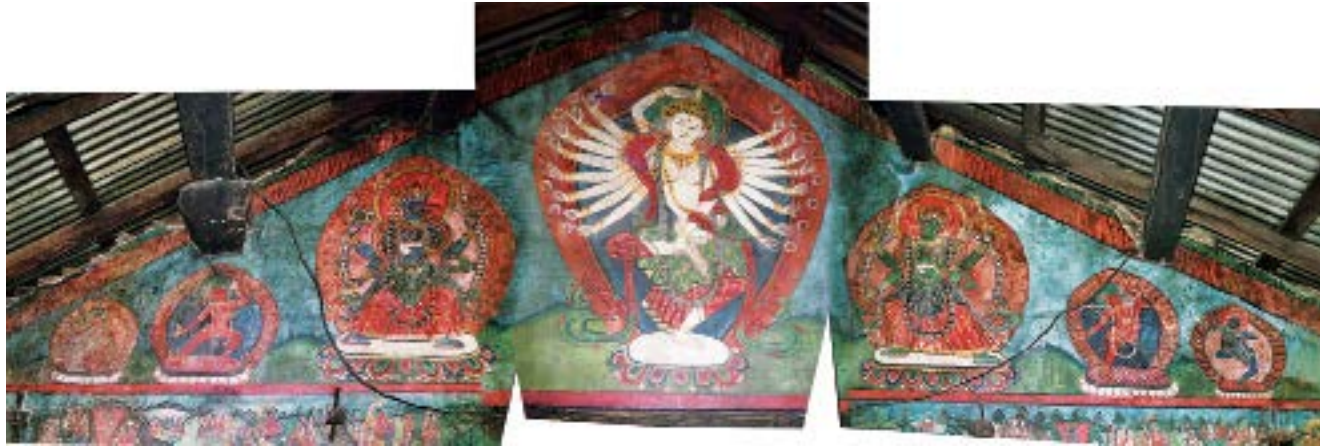
Plate 7. The upper portion of the south wall above the narrative registers inside the vestibule of Śāntipur. The dancing deity in the center is Padmaṅṭyeśvara (Newari: nāsadyab), a form of Lokeśvara, who plays an important role in the Newar tradition as the deity presiding over the initiatory practice of tantric songs and dance. He is flanked by two of the guardian deities of the Cakrasaṃvaramaṇḍala, namely the blue, crow-faced Kākāsyā and the green, owl-faced Ulūkāsyā. In turn Kakāsyā and Ulūkāsyā are flanked by three forms of Vajrayoginī and, on the far right, Nairātmyā.