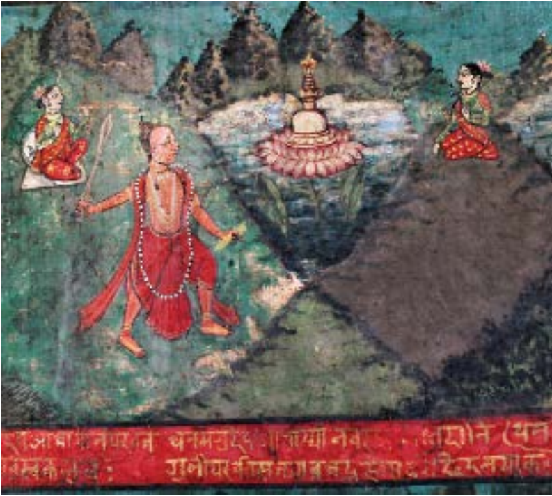
Plate 10. A scene on the northern wall (subsequent to plate 9) depicting how Mañjudeva cut a gorge into the encircling ring of mountains in order to drain the lake, an event the murals locate before at Dakṣiṅkāli in the very south of the valley, where the Bāgmatī exits. In his other hand, Mañjudeva holds a book as a marker of his identity as Mañjuśrī, the wisdom bodhisattva. He is accompanied by his two consorts, who can be seen on either side of the lake looking on. The caption reads: “Here, having set up his two (consorts) Varadā and Mokṣadā (lit.: Boon-Granter and Liberation-Granter) on the (surrounding) mountains, the master Mañjudeva cutting (an outlet) with his sword Candrahāsa (so named because its brilliance mocks the moon)” ( thana mañudeva ācāryyāna varaḍā mokṣadā nigulī pararvatasa tayāva candrahāsa ṣaḡe chedana yāka :).