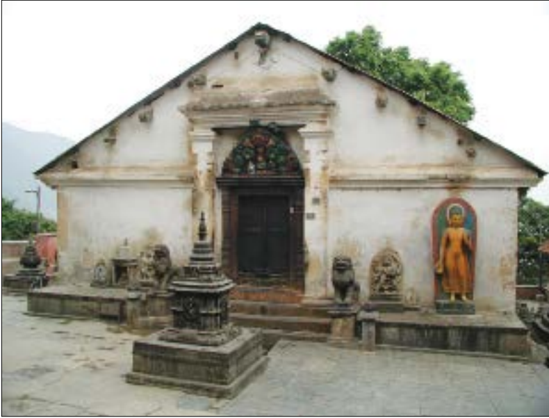
Plate 4. The southern side of the shrine of Śāntipur up at Svayambhū to the north of the caitya . This is the sole entrance to the vestibule with the depiction of the Svayambhūpurāṇa on its four walls.